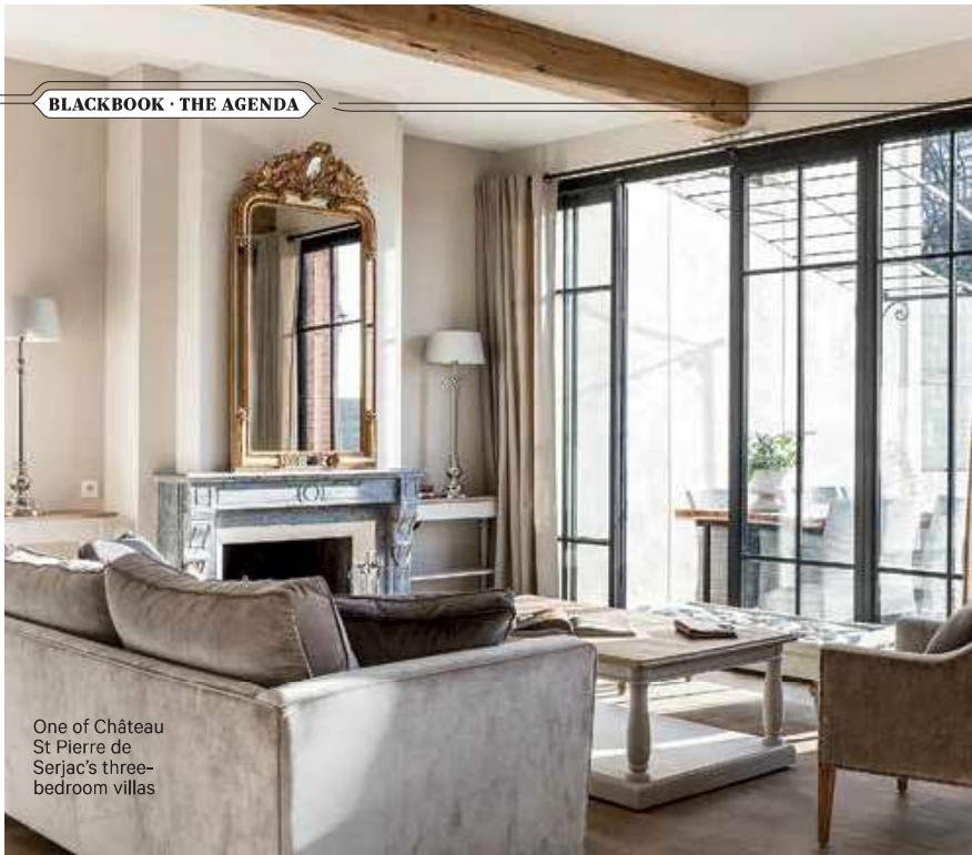
One of Château St Pierre de Serjac's three-bedroom villas