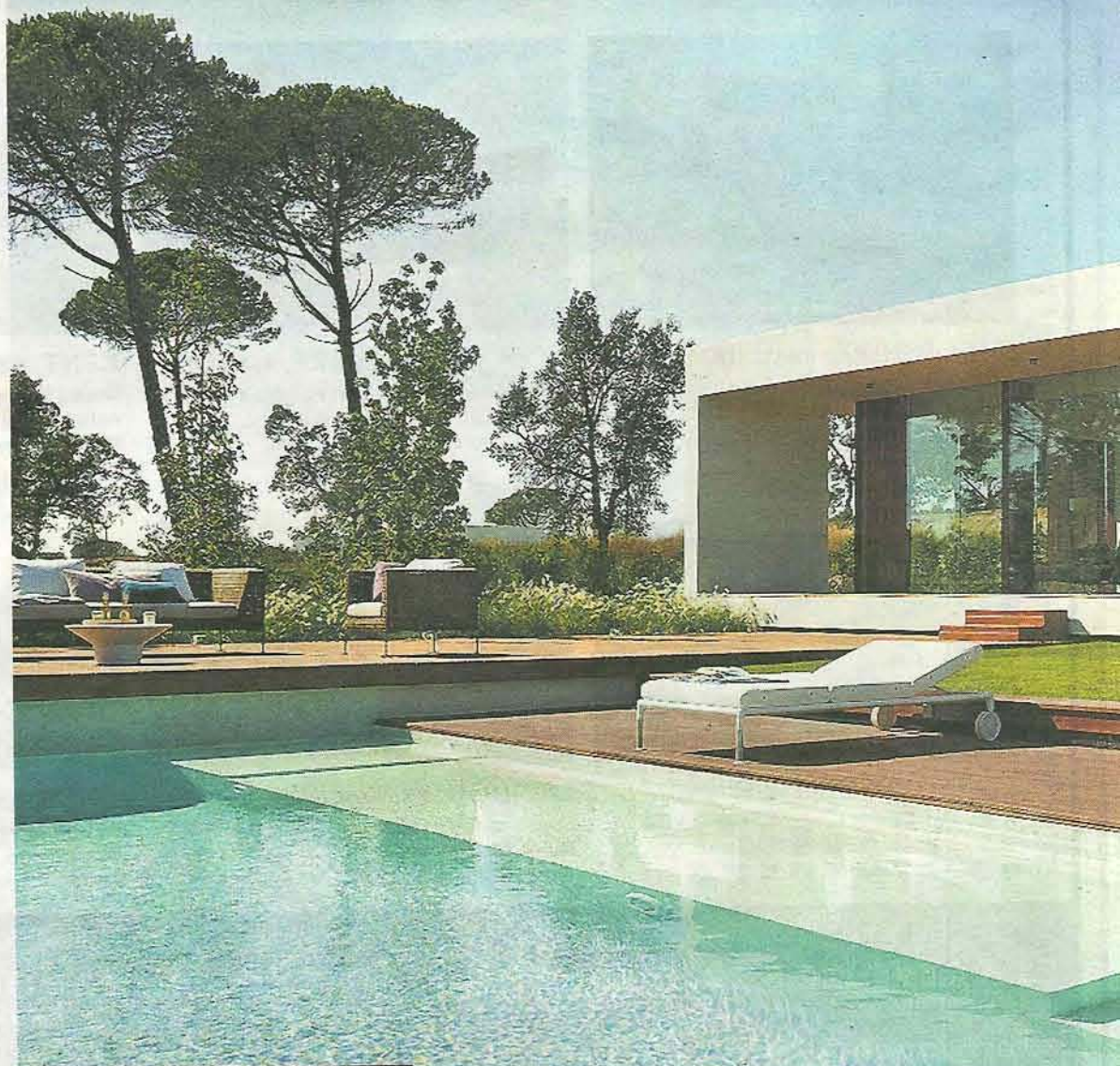
Villas at the PGA Catalunya Resort, near Girona, have been selling well