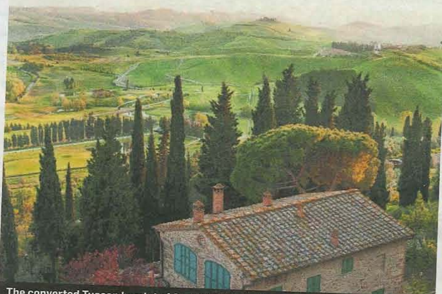
The converted Tuscan hamlet of Castelfalfi, near Pisa, covers 1,100 hectares. One-bedroom flats can be had for £196,000, farmhouses for £2.1m. castelfalfi.com

The Albany has the celebrity factor: 15 sports stars (mainly golfers) own there, and Daniel Craig’s famous swimming-trunks moment happened on the beach. The leisure and family facilities, including a water park, are first-class, too. Yet buyers, 20% of whom are British, are most interested in the tax perks — no income, inheritance or capital gains tax, as well as no property taxes for 20 years, and no import duty on building materials or furnishings. Buyers who spend more than £1m can also apply for residency.