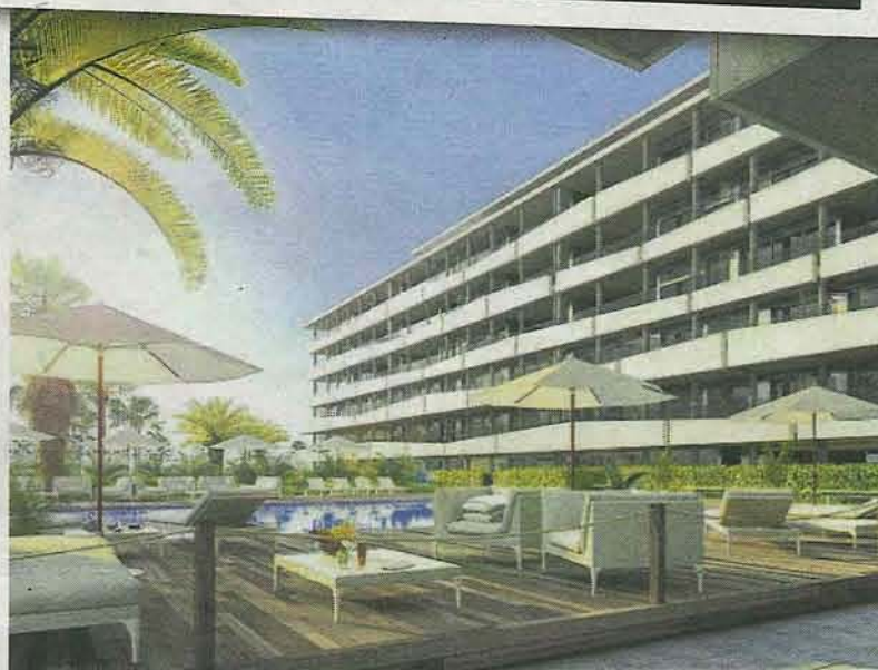
On Ibiza, the White Angel has attracted interest from British buyers. Two-bedroom flats start at £230,000. thewhiteangelibiza.com