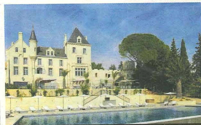
Château Les Carrasses is a converted 19th-century wine estate in the Languedoc. Flats started at £174,000 and sold out within five months

While property prices stagnate worldwide, new hideaways with rental perks are paying divi