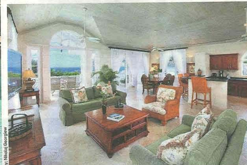
The Royal Westmoreland estate, on Barbados, is popular with sports stars. One-bedroom flats start at £260,000. royalwestmoreland.com