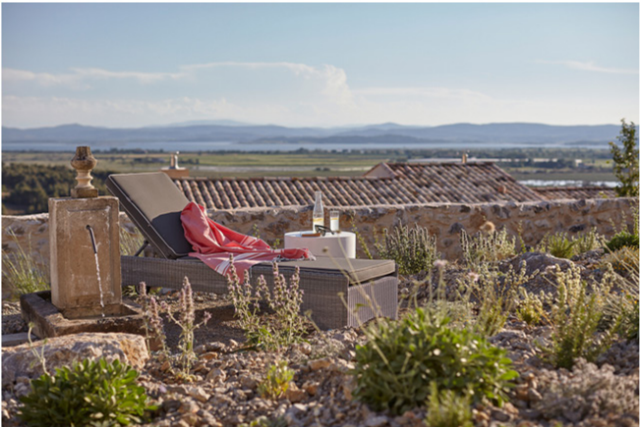
Landscape around Château Capitoul

The spring following the property's September 2021 opening, we settled into one of the eight stylish rooms in the 19th-century chateau and began our countryside sojourn. From the windows, a tapestry of vineyards covered the 240-acre estate leading to the neighbouring villas. Some as large as 220m 2 boasting private pools made for the perfect self-catered family refuge. My plans were focused on well-being as I took the winding stone stairwell down to the intimate Cinq Mondes spa for a rejuvenating massage. Following an hour of sensorial bliss, I sank into the bubbling jacuzzi and heated pool – skipping the 30m outdoor infinity pool – while my husband explored the landscape by bike. The maze of paths weaving through the estate made bicycling the transportation mode of choice at Château Capitoul, along with a ride in the golf carts. Meanwhile, the blossoming Mediterranean gardens curated by world-renowned landscape designer James Basson could best be enjoyed on foot.