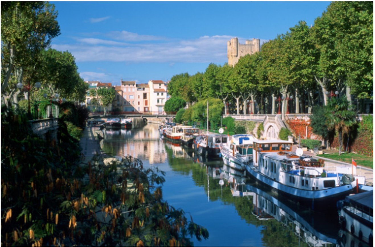
Narbonne, courtesy of Château Capitoul