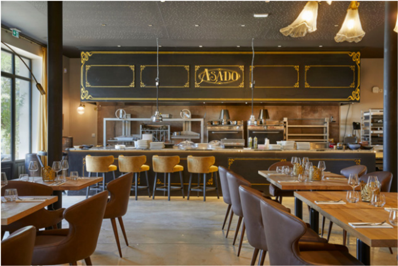
Asado grill area