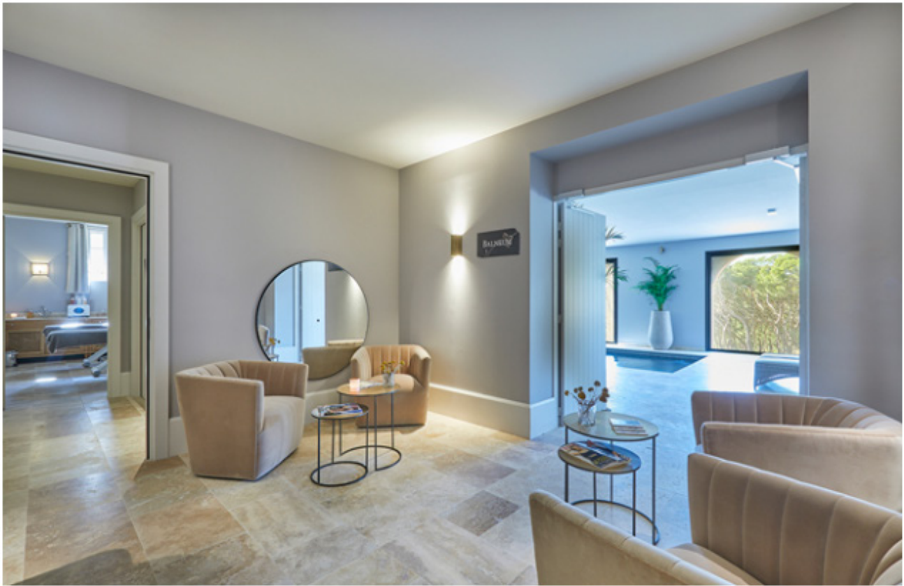
Spa waiting room